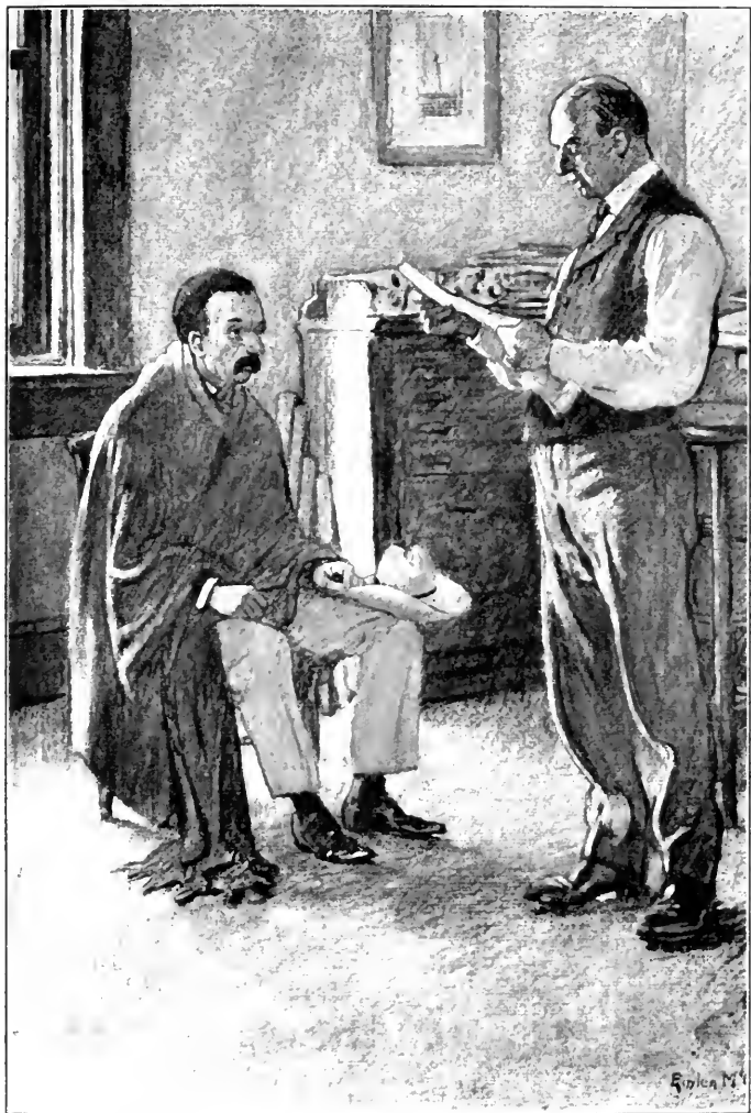
He looked like a conspirator of the plot, or the assassin who had just slipped up the dark alley